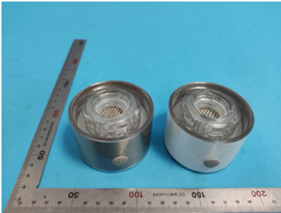
All view of EUT